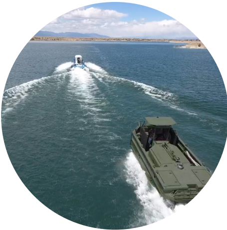
RAPTOR 1 - BEB